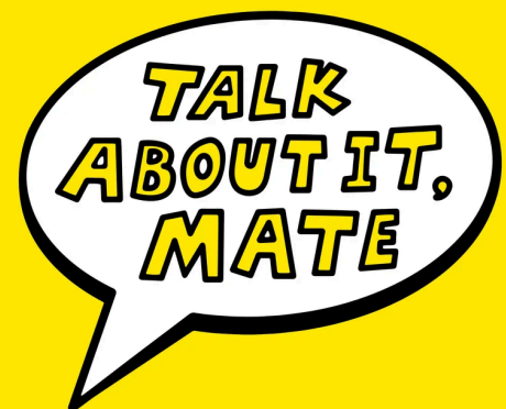
Talk about it mate ↔

Langworthy Cornerstone, Liverpool Street, Salford