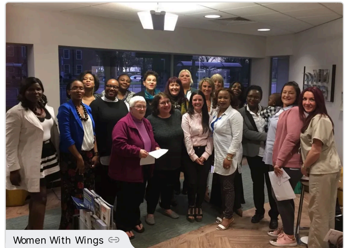
Women With Wings ↔

Women With Wings, Little Hulton District Centre, Little Hulton, Manchester