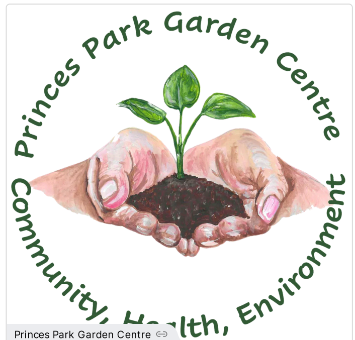
Princes Park Garden Centre ⇌

Princes Park Garden Centre and Training Hub, Liverpool Road, Irlam, Manchester