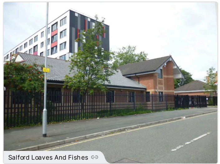
Salford Loaves And Fishes ⇌

Salford Loaves and Fishes, Paddington Close, Salford