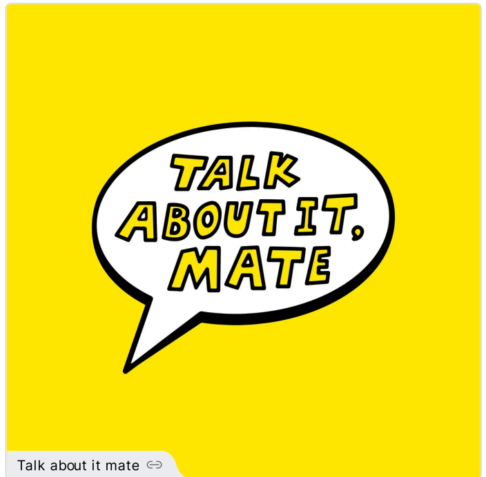
Talk about it mate ⇌

Langworthy Cornerstone, Liverpool Street, Salford