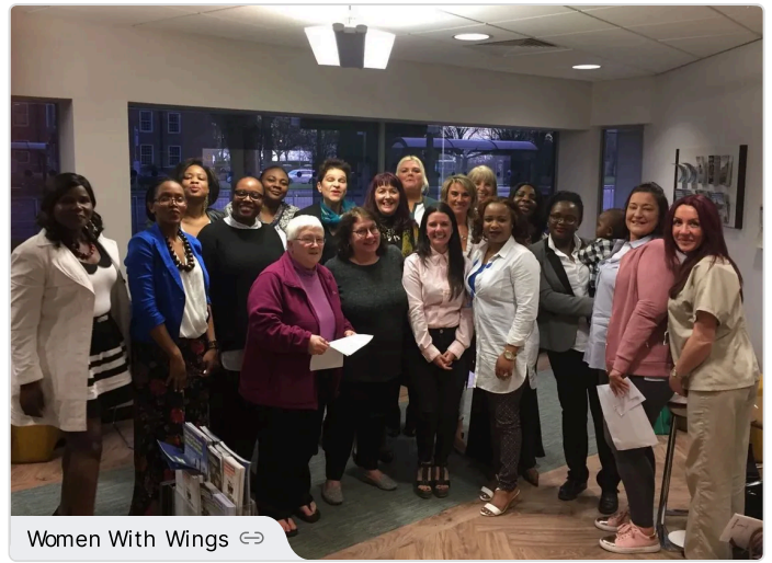
Women With Wings ⇌

Women With Wings, Little Hulton District Centre, Little Hulton, Manchester