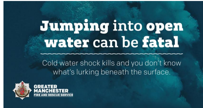
Water Safety - Greater Manchester Fire & Rescue