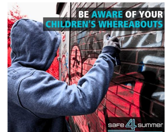
Safe4Summer Greater Manchester