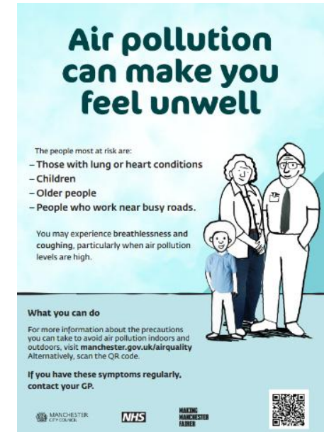
Air Quality - Manchester