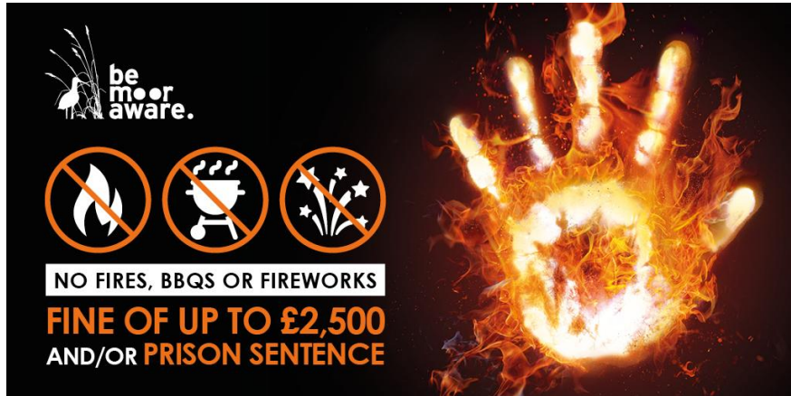
Be Moor Aware - Greater Manchester Fire & Rescue