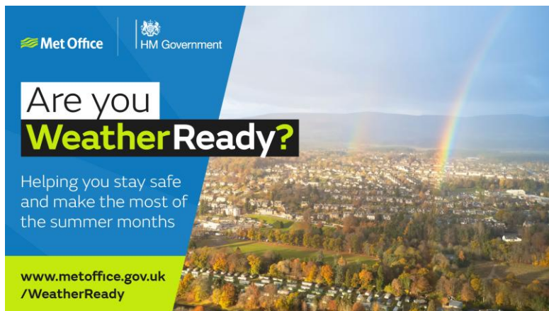
Weather Ready summer toolkit - Met Office