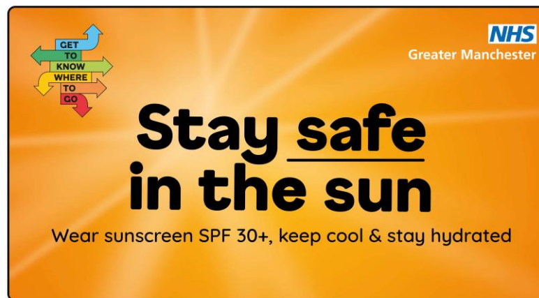
Get To Know Where To Go - NHS GM